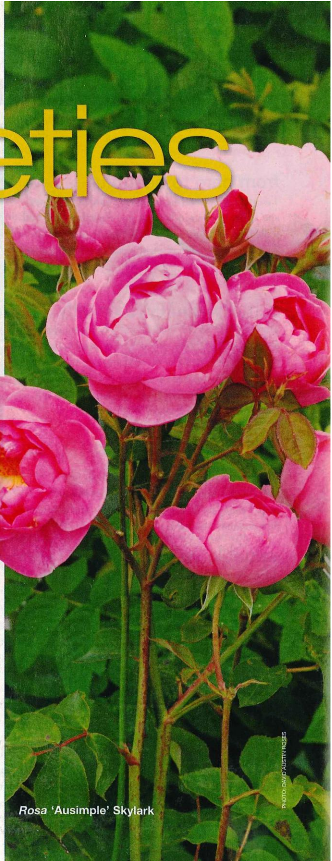
Rosa 'Ausimple' Skylark

To see even more new plants, visit www.gardeningclub.com and click on WebExtras.